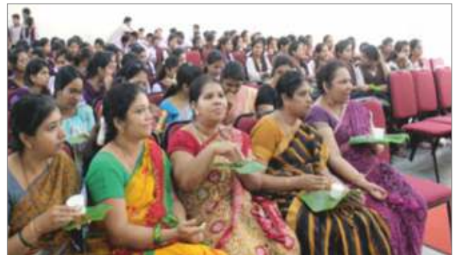
Enjoying the seasonal food by the faculty and students