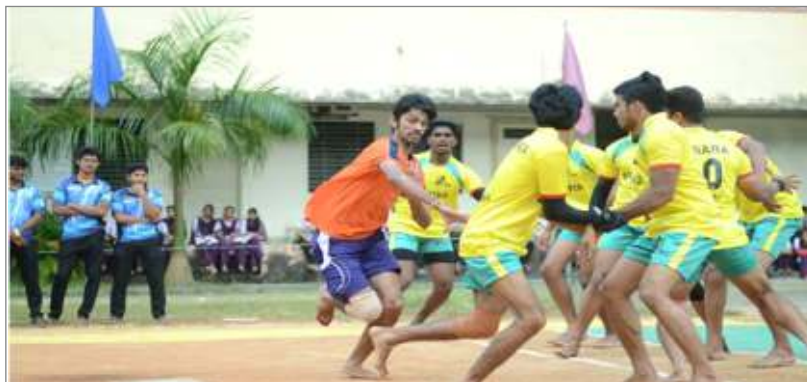
A glance of the kabaddi tournament