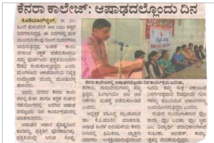
Udayavani 23rd August 2016