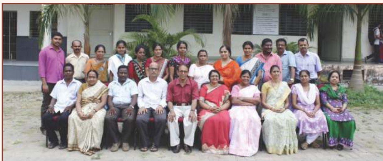
Non Teaching Staff