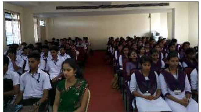
Practical session on Meditation