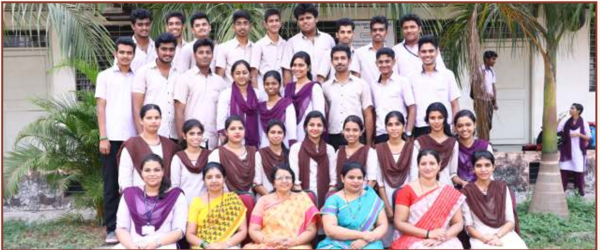
Konkani Bhasha Mandala