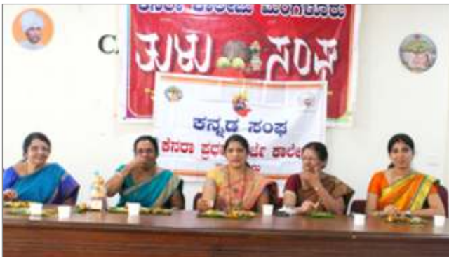
Enjoying the seasonal food by the Principal and staff conveners