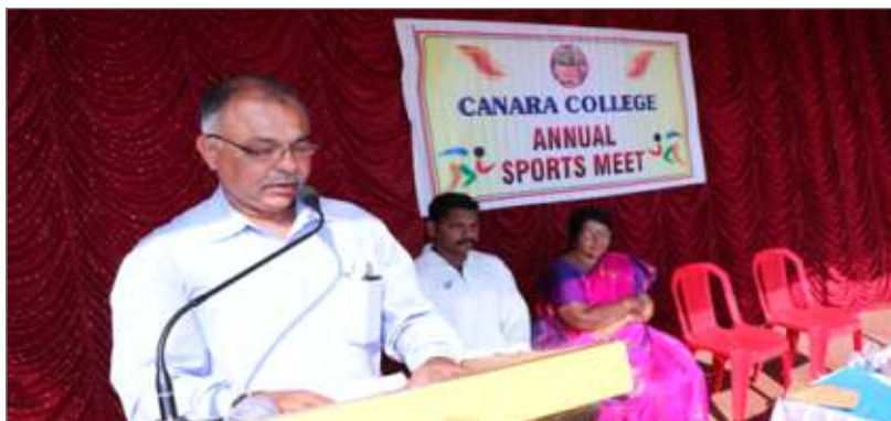
Esteemed guest delivering his speech