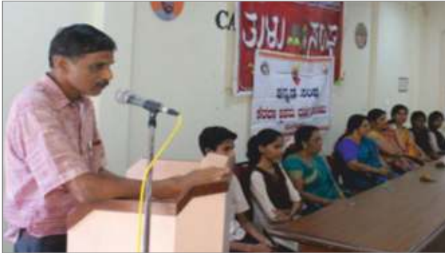
Chief guest addressing the gathering