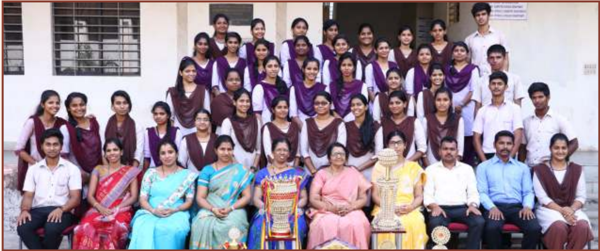
Fine Arts Association