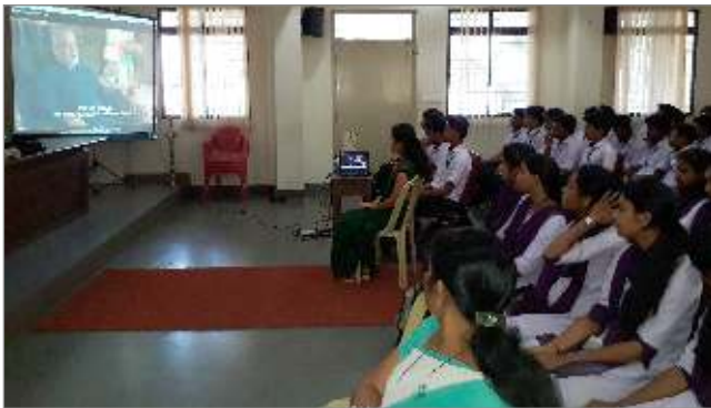
Guidance on Meditation