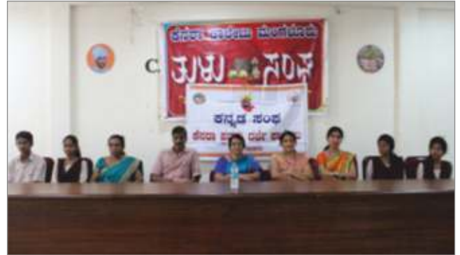
Aatidonji dina celebration