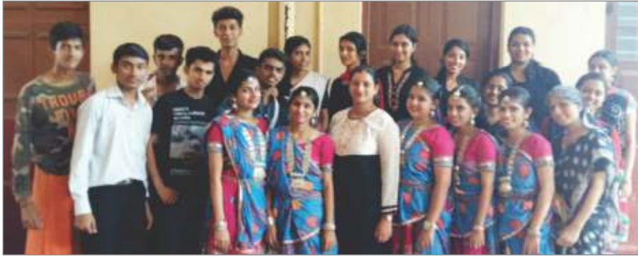
All the above were based on Konkani culture and traditions.